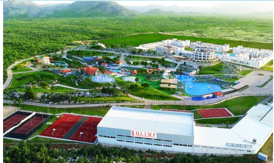
The "City of the Sun" multifunctional complex in Trebinje

The WSC Volleyball 2023 will be held in this multifunctional complex, in which we have in one place everything needed- accommodation, sports facilities (sports hall and open sports facilities), entertainment, as well as other services.