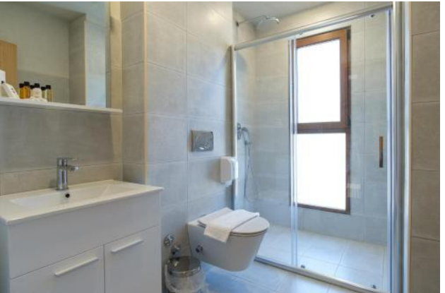
Accommodation for participants