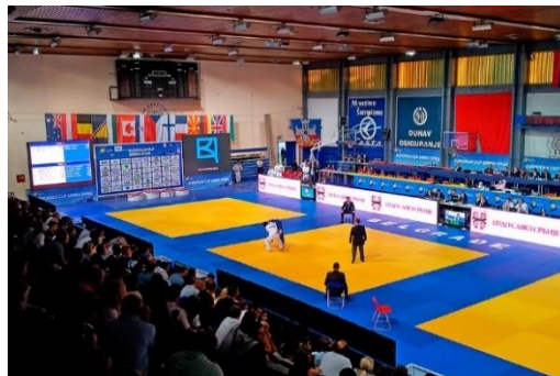
Sports Hall - Šumice