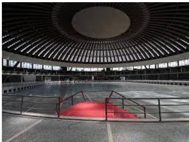
Sports Hall – Belgrade Fair Hall 5