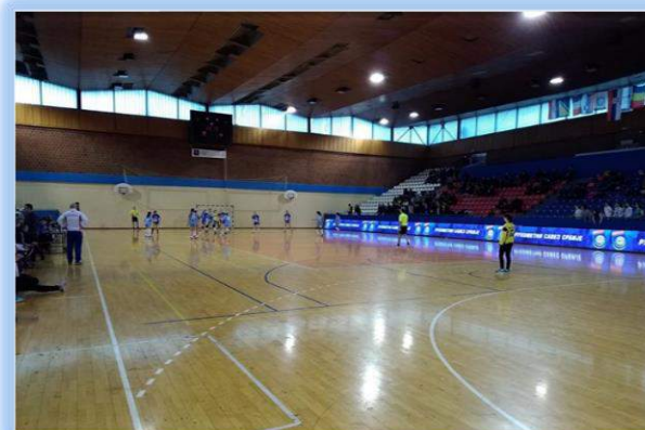
Sports Hall "Banjica"