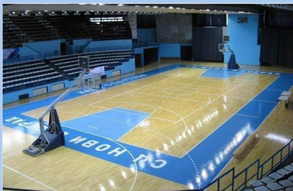
Sports Hall "Ranko Žeravica"

The competition will take place in some of following venue(s):