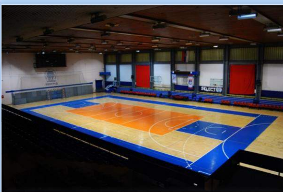
Sports Hall "Šumice"