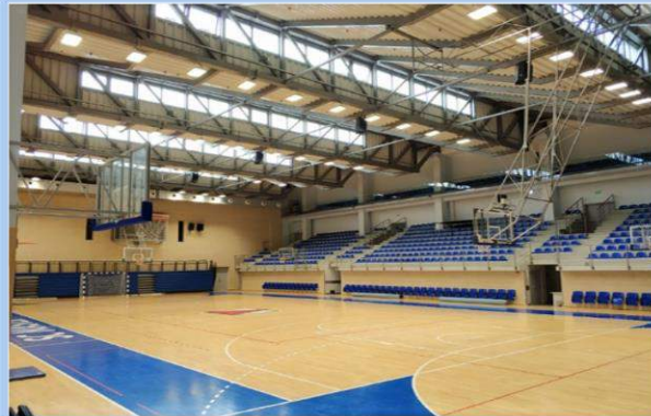
Sports Hall "Master"