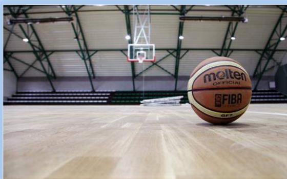
Sports Hall "Žarkovo"