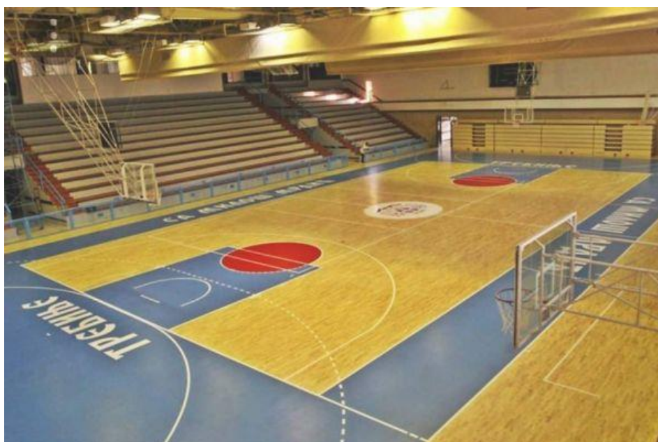
City Sports Hall "Miloš Mrdić"