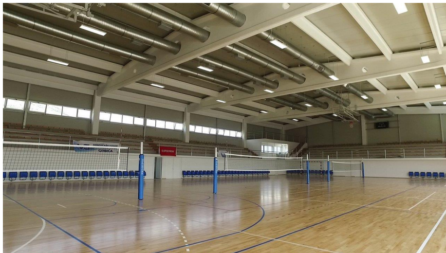
Sports Hall "Olimp-Grad sunca"