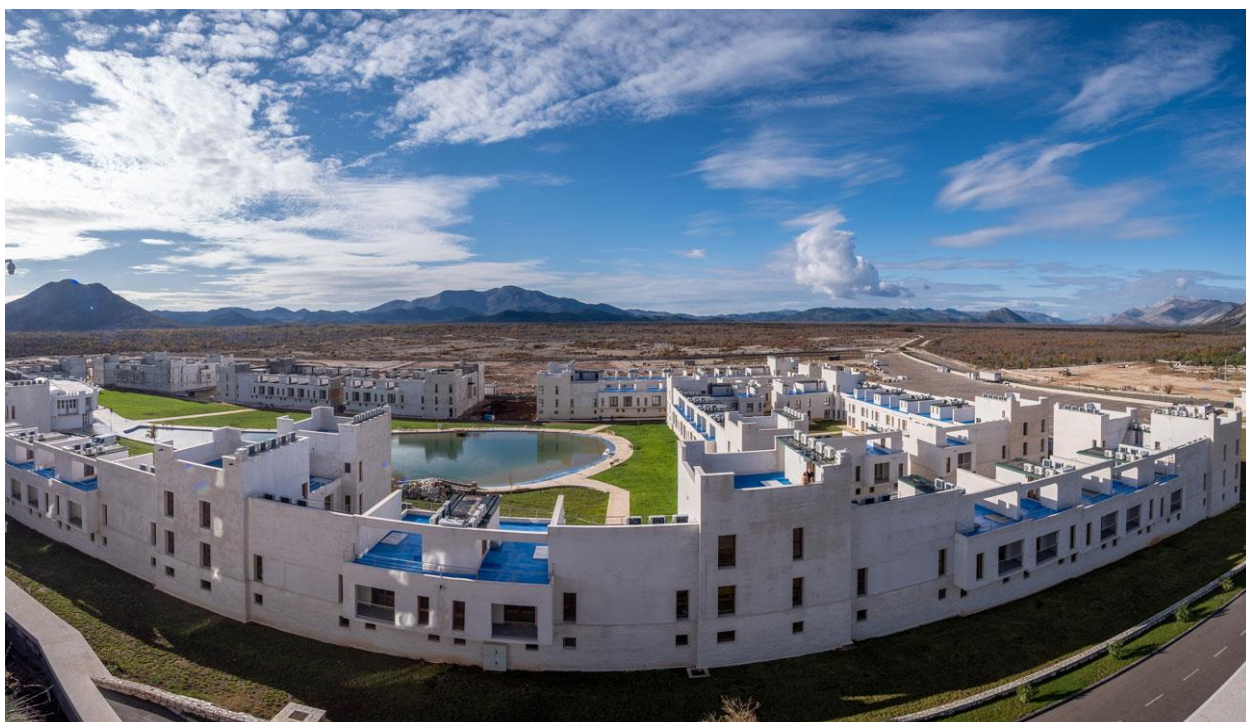
The “Sun City” multifunctional complex in Trebinje

In the “Sun City” – Grad sunca, there is the largest aqua park in the Balkans “Sunčana vrela”, the luxury hotel “SL Panorama”, the sports-recreational facility “SL Olimp” (with an indoor swimming pool, a gym, a multifunctional hall, open and closed fields for football, basketball, volleyball and tennis), wellness and spa center “Galija”, ethnic village and Varoš bazaar, children's park “Dino Park”, apartment complex “Bijeli grad”, auto-camp and coliseum.